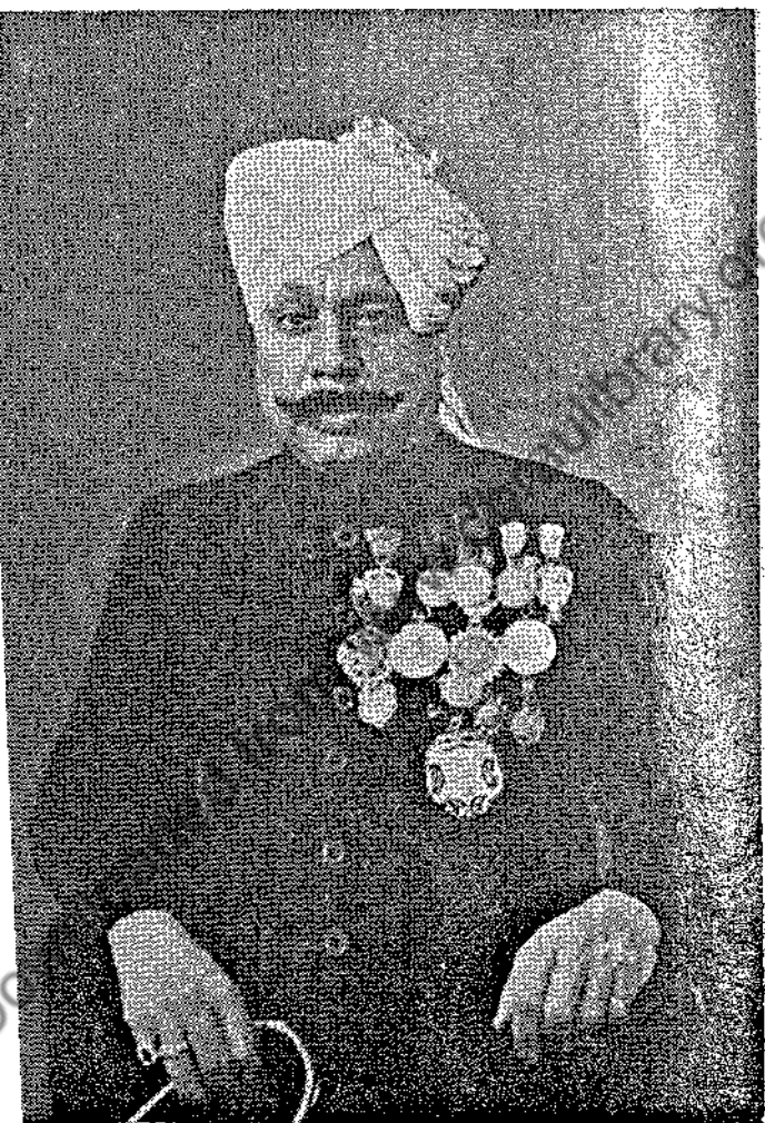
Ustad Faiyaz Khan—The Foremost Musician.