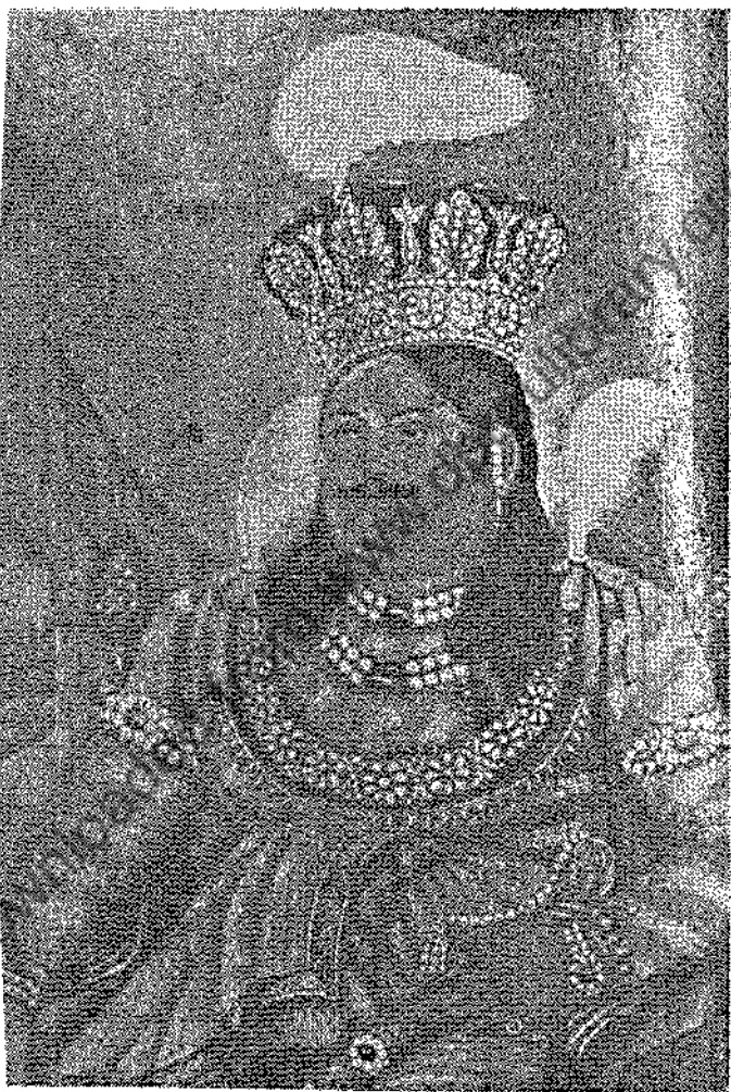
Nawab Wajid Ali Shah--The Lover of Music.