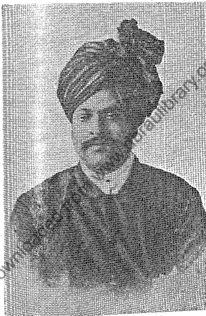
Shri Vishnu Digamber—The Great Devotee.