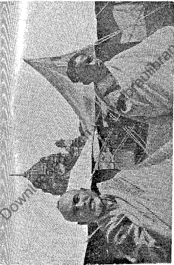
Ustad Ali Akbar Khan—the worthy son of a note worthy father Ustad Allahuddin Khan Sahib—A Great Exponent of Music.